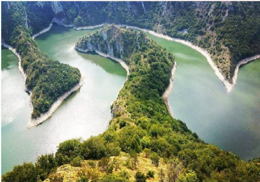
Uvac is my home, this is where I am at my happiest and totally at peace. I go to Uvac whenever I need to escape from the stress of everyday life and just sit there for hours contemplating my surroundings.

It is located in the centre of the Balkan Peninsula, in south-eastern Europe. The northern portion belongs to central Europe, but in terms of geography and climate it is also partly a Mediterranean country. Serbia is landlocked but as a Danube country it is connected to distant seas and oceans. Serbia is a cross roads of Europe and a geopolitically important territory. The international roads and railway lines, which run through the country's river valleys, form the shortest link between Western Europe and the Middle East.